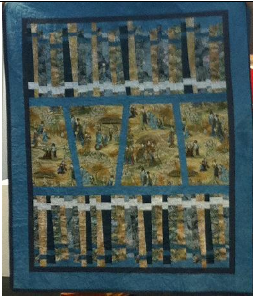
Japanese Tumbler - Bev McLeod