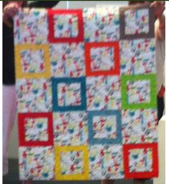
Charity Quilt - Peta Turnbull