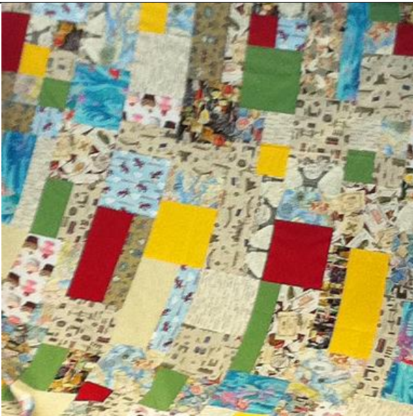
Travel Quilt - Louise Boyd