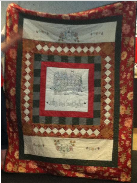
Stitcheries Gone Mad! Rita Trotta