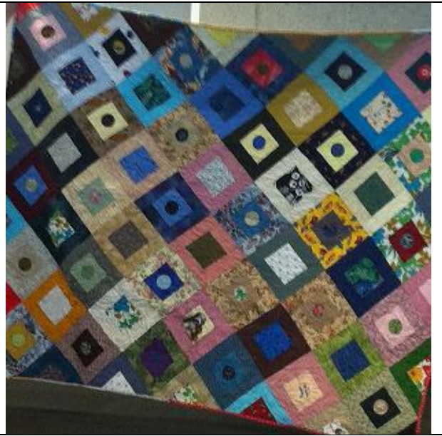
Squares & Circles - Lois Mawby Quilt donated to RSPCA