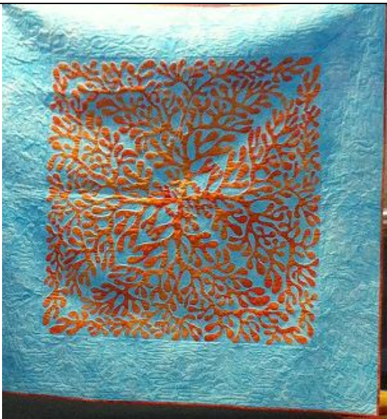
Coral Reef - Chris Simonic