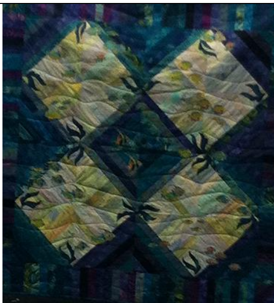
Fish, Coral de Rose