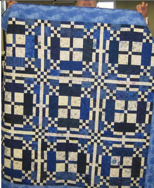
Blues, Tricia Salau