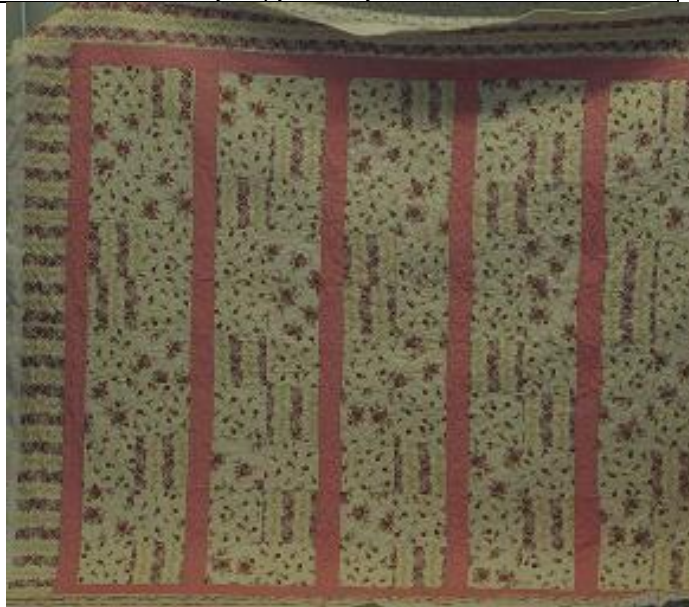
Florals, Debbie Soccio