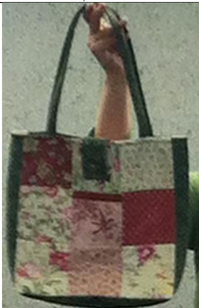
Patchwork Bag, Alida Lahiff