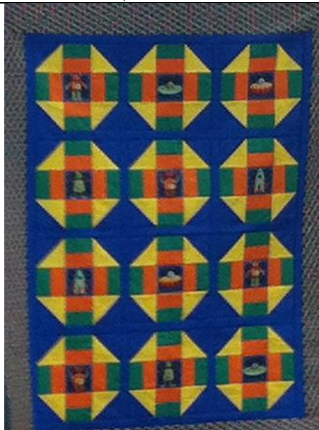
Charity Quilt, Peta Turnbull