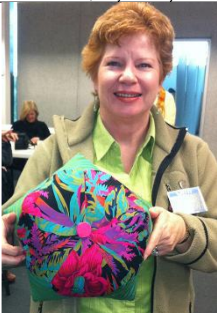
Stool, Cath Clarke (from Beverly McLeod's workshop)